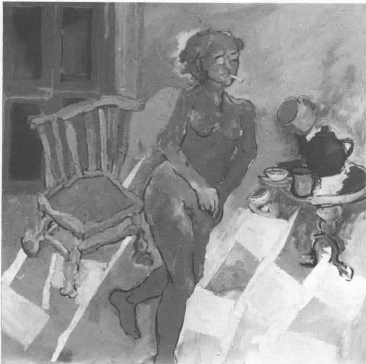
The Tea Strainer by Sally Hall Acrylic, Oil and Collage 120 x 120 cms 1986